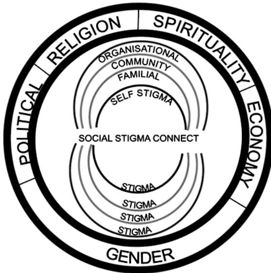
Figure 1. Oтуру's typological stigma framework

Self stigma refers to the state whereby a patient feels that everyone is aware of his/her diagnosis and attempts to isolate himself/herself. The patient may experience emotional turmoil, fear, depression, anxiety or other emotional problems. It is critical that support from the health and social services be available to the patient as he/she weighs available options.